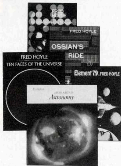
A sampling of Hoyle's books

Fred Hoyle on a mountaintop near his home in England's Lake District