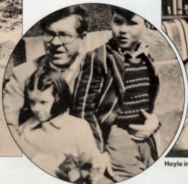
Hoyle with his children, Elizabeth and Geoffrey, in 1950