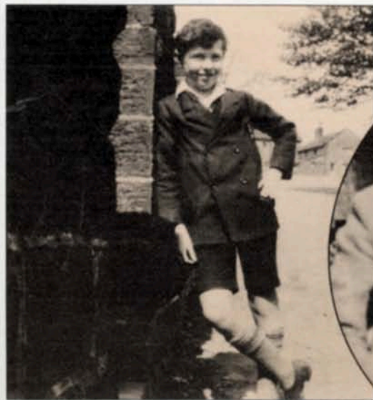
The astronomer as a young boy