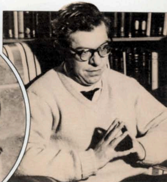
Hoyle in his Cambridge office, 1966